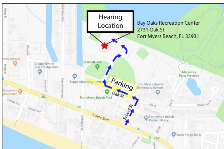
Hearing Location - 2731 Oak Street, Fort Myers Beach, FL 33931

Join Us for a Public Hearing on Thursday, March 19, 2020